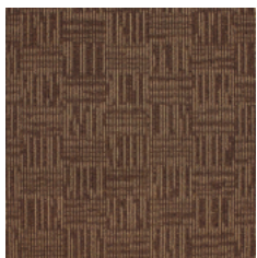
CHORUS - 848