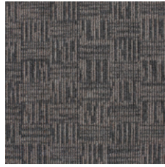
CHORUS - 875