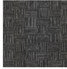
CHORUS - 876