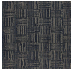
CHORUS - 877