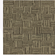
CHORUS - 897